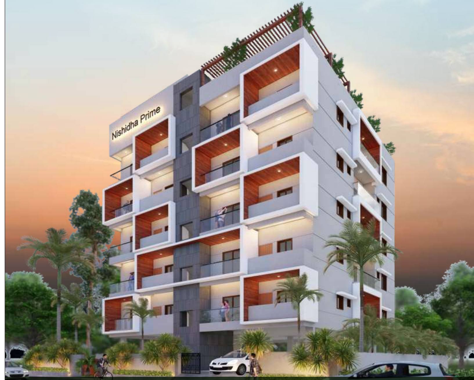
3 BHK LUXURY APARTMENT @ NANDYAL ROAD, KURNOOL.